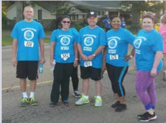
Members Exchange volunteered at the Byram Swinging Bridge Festival and walked in the 5K.