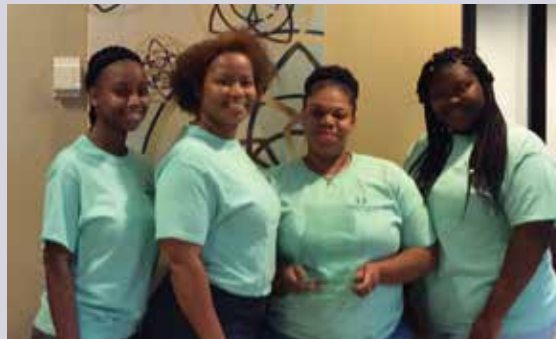
Congratulations to our Member Service Center for being chosen “Branch of the Quarter” by our members!

Members Exchange accepts the #LACUStrong Challenge from the Louisiana Credit Union Foundation. Our team members made a video doing 20 exercise reps in support of the 20 credit union branches that suffered damages from the flooding, as well as donated $1,000 to the cause.