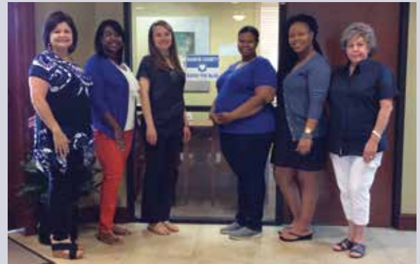
Pearl Branch “Backs the Blue” by wearing blue as a community-wide initiative to support local law enforcement.