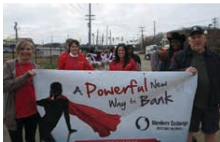
Members Exchange was a sponsor of the recent Dixie National Rodeo, the largest rodeo east of the Mississippi River. As a part of the sponsorship, Members Exchange participated in the Dixie National Rodeo Parade held on Saturday, February 8th in Downtown Jackson.